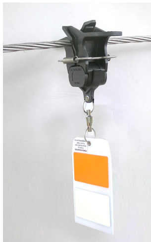
Clamps securely to conductors from 6 –70 diameter, including ABC