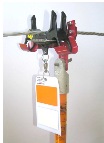
Fitting to overhead wires with red application tool and hot stick.

The firefly is made from long lasting UV resistant materials with a stainless steel swivel. The strongly sprung 3 finger clamp has been proven in use world wide for 20 years and will attach to hi voltage power conductors, ABC, earth wires, stays and guys, angle steel, pipes etc. It also works attached at right angles to structures.