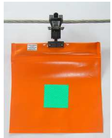
30 cm marker snapped onto wire